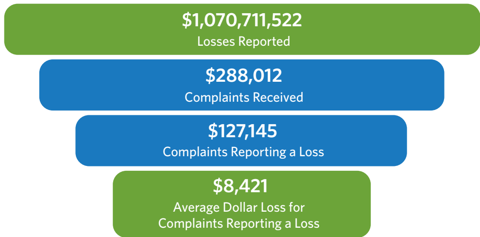
Figure 2. Internet-facilitated crimes tracked by the FBI's Internet Crime Complaint Center.

300,000 internet- facilitated crime complaints tracked by the FBI each year