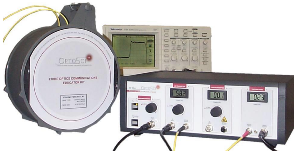
N.B. Oscilloscope not included